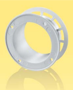
F 250 - F 315 Series