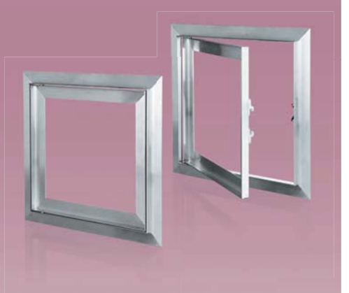
Access doors for plasterboard applications