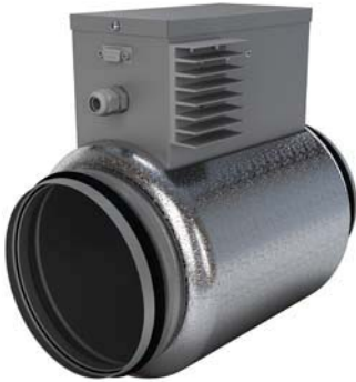
Heater for heat exchanger freeze protection