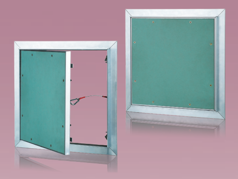
Access doors for plasterboard applications