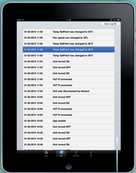
Event and user activity log